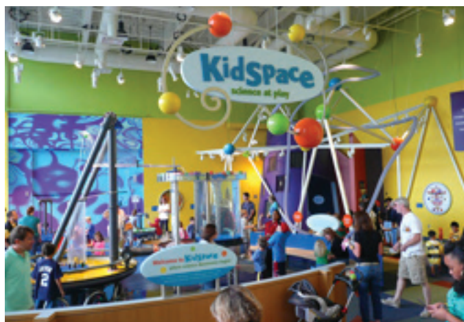
The newly opened KidSpace features water play and creative play areas.

http://www.ctcase.org/reports/waste_heat.pdf