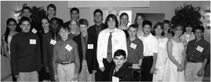
Young scientists are honored at the Academy's Annual Dinner.

Governor M. Jodi Rell issued an Official Statement to each high school in recognition of this outstanding achievement.