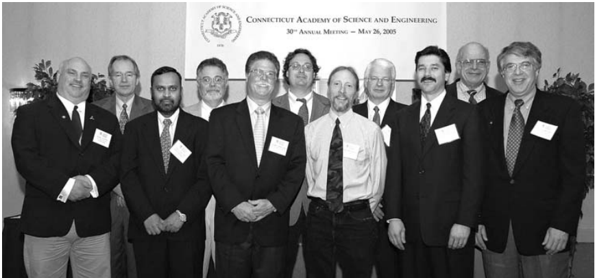
Newly elected members of the Academy pose for a picture at the Annual Meeting on May 26, 2005.